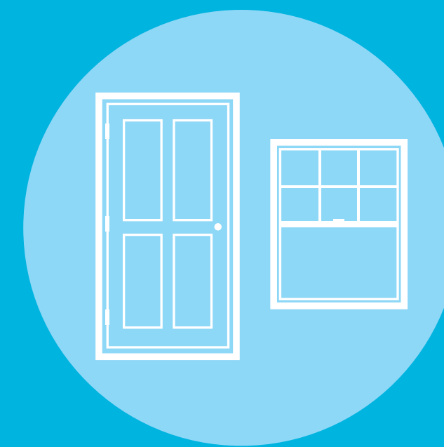
doors & windows