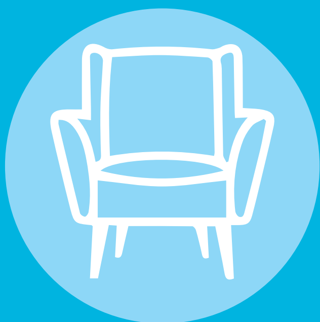
furniture, housewares & décor