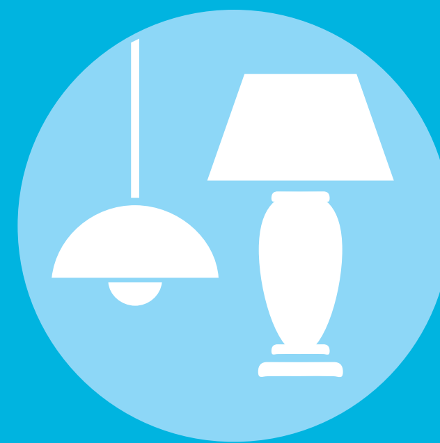
lighting & lamps