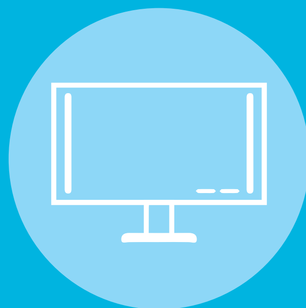
TVs & electronics