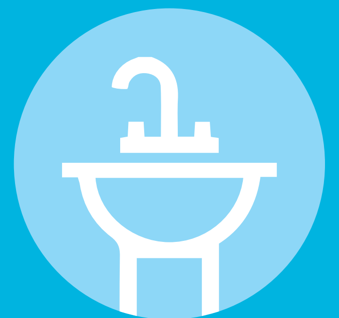
kitchen & bath fixtures